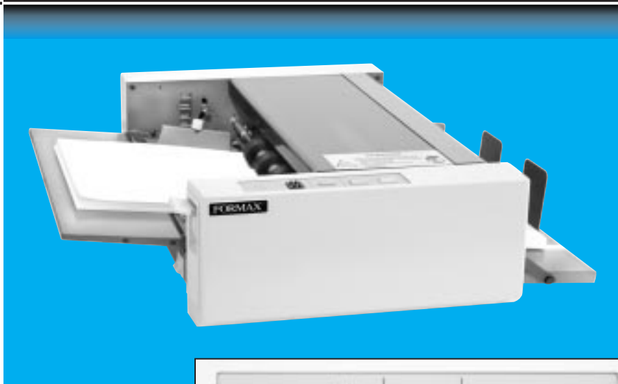
Operator Friendly Control Panel